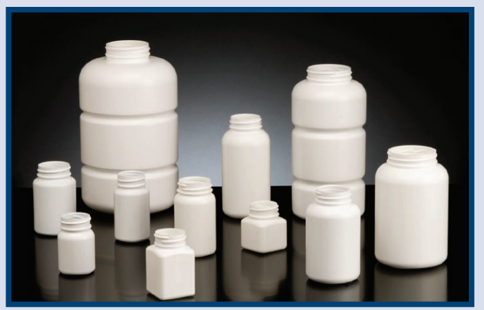
Oxy-Guard<sup>TM</sup> Barrier Bottles are available in several sizes and configurations and feature a standard SP 400 neck.

For a complete solution, Oxy-Guard bottles can be used in conjunction with PharmaKeep® oxygen scavengers, which absorb the oxygen contained in the container headspace after drug filling and the small amount of oxygen that may still permeate into the container during shelf life.